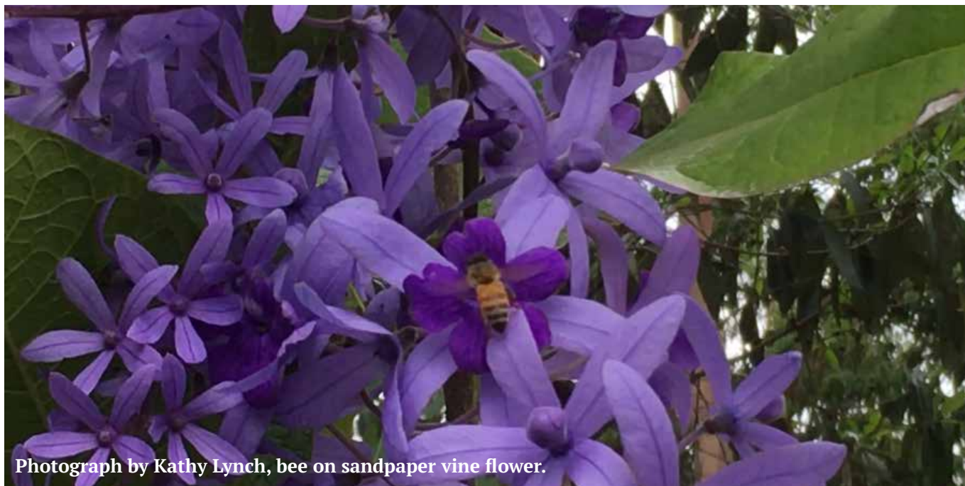
bee on sandpaper vine flower.