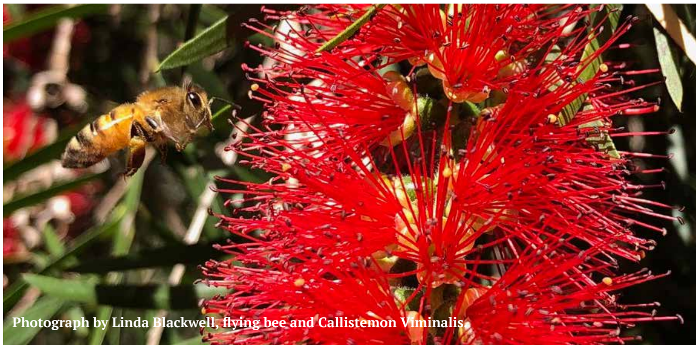
flying bee and Callistemon Viminalis